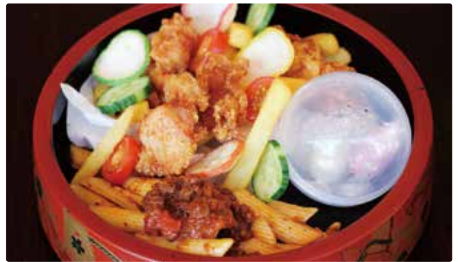
B Pasta Set [G] ..... 15 MEAT SAUCE PASTA W/ DEEP FRIED CHICKEN, CHIPS, SALAD