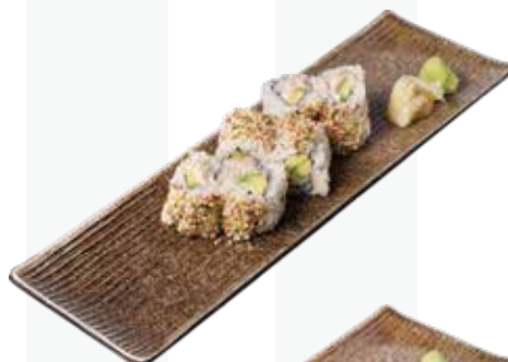
Cooked Tuna & Avocado Inside-out Roll* 6 PCS 10