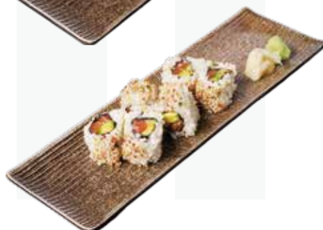
Salmon & Avocado Inside-out Roll* 6 PCS 11

MENU ITEMS ARE GLUTEN-FREE UNLESS SPECIFIED *GLUTEN-FREE OPTION AVAILABLE [G] CONTAINS GLUTEN