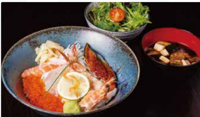
Kaisen Sashimi Don* ..... 32 ASSORTED SASHIMI W/SUSHI VINEGARED RICE