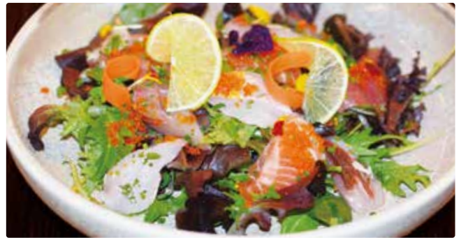
Kaisen Sashimi Salad [G] ..... 24 GINGER SEEDED MUSTARD PONZU