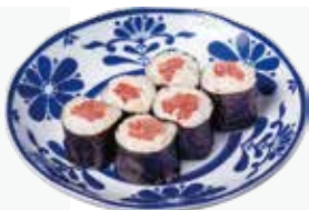
Fresh Tuna Roll 6 PCS 9