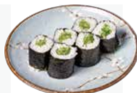
[VEG] Cucumber Roll 6 PCS 7