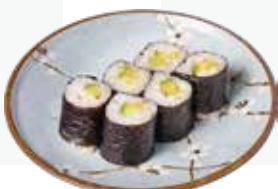
[VEG] Avocado Roll 6 PCS 7