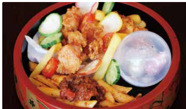
B Pasta Set [G] ..... 15 MEAT SAUCE PASTA W/ DEEP FRIED CHICKEN, CHIPS, SALAD