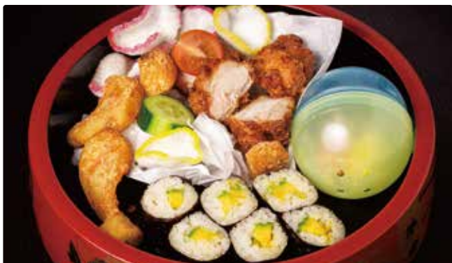
A Roll Set [G] ..... 15 AVOCADO or SALMON (+$3) ROLL 6 PCS W/ DEEP FRIED CHICKEN, CHIPS, SALAD