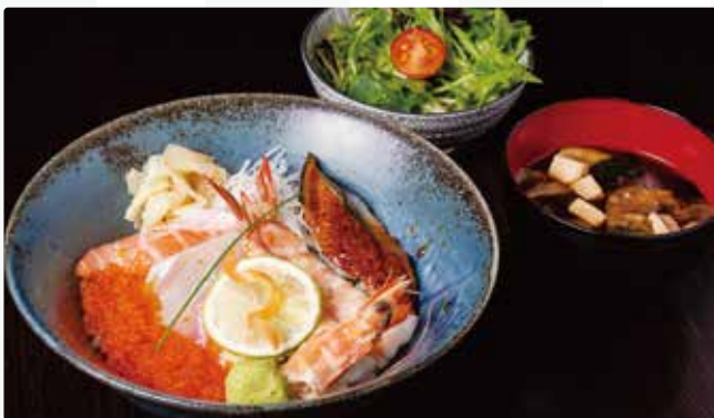
Kaisen Sashimi Don* ..... 38 ASSORTED SASHIMI W/SUSHI VINEGARED RICE