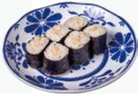
Cooked Tuna Roll 6 PCS 8