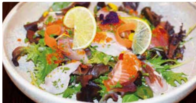
Kaisei Sashimi Salad [G] ..... 24 GINGER SEEDED MUSTARD PONZU