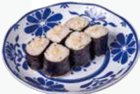
Cooked Tuna Roll 6 PCS 8