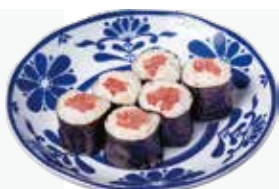
Fresh Tuna Roll 6 PCS 9