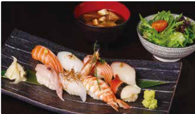
Sushi ..... 28 8 PCS / CHEF'S SELECTION