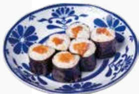
Fresh Salmon Roll 6 PCS 9