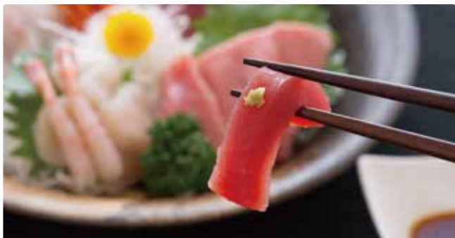
Sashimi ..... 32 12 PCS / CHEF'S SELECTION